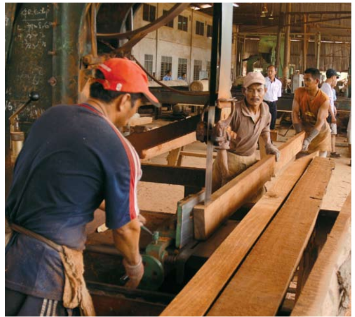
Above: Triton wood harvested from Lake Kenyir, Malaysia brings value to local communities

"Through this underwater logging initiative, the company is working with regional stakeholders and the government to develop an