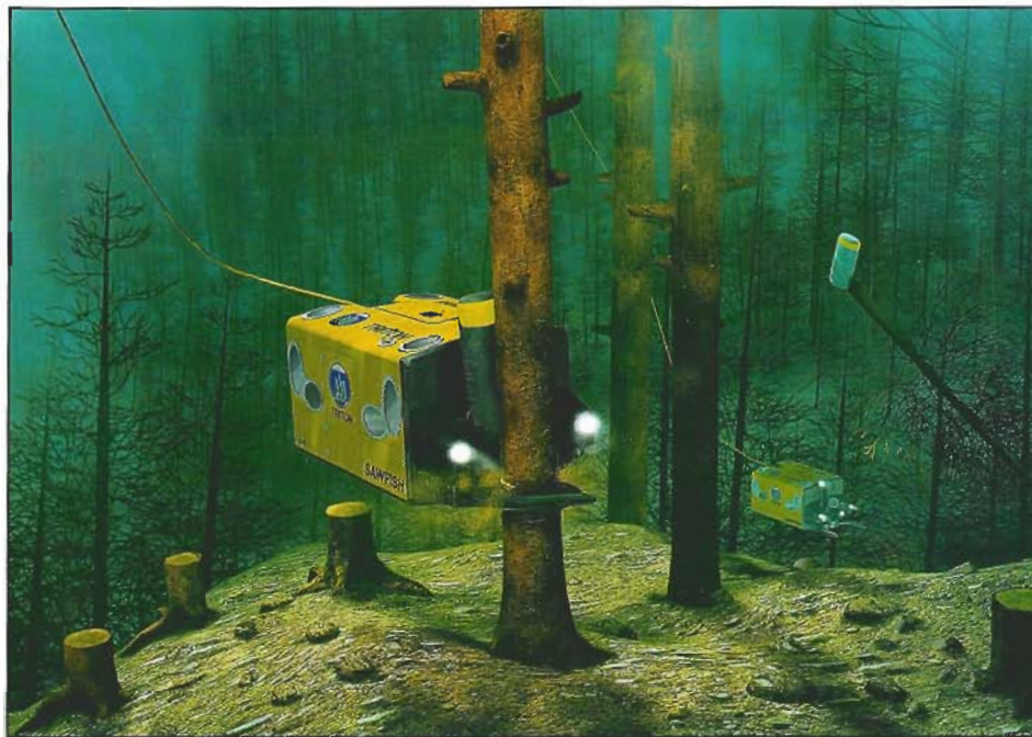
The Sawfish grabs the tree with 4-foot grapples, attaches an airbag, and then cuts the tree - the airbag providing lift to the waterlogged tree.

A: Traditional underwater logging techniques have ranged from divers and chain-saws to cranes and grapples, both of which can be unsafe and environmentally damaging. To solve those problems, plus the challenge of reducing cut/retrieval cycle times, Triton invented the Sawfish Underwater Harvester. The Sawfish is a remotely operated vehicle (ROV) about the size of a small minivan outfitted with eight video cameras, sonar, GPS and seven thrusters powered by a 75 HP electric motor. The Sawfish grabs the tree with 4-foot grapples, attaches an airbag, and then cuts the tree - the airbag providing lift to the waterlogged tree which would otherwise sink. At the